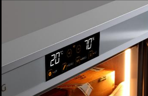
Black LCD touch panel