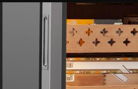
Concealed Door Handle