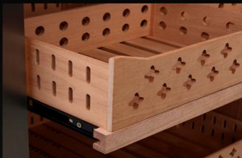
Shelves with rails