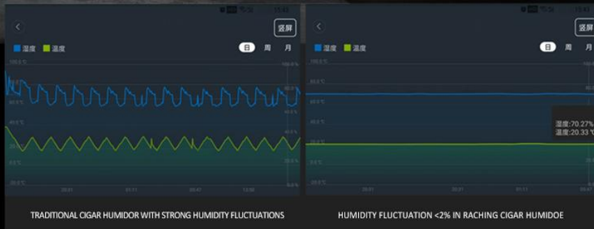
TRADITIONAL CIGAR HUMIDOR WITH STRONG HUMIDITY FLUCTUATIONS