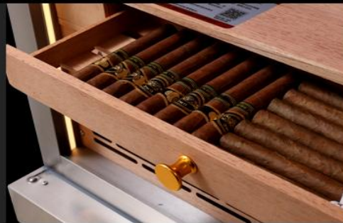
Freestanding cigar humidity adjustment area